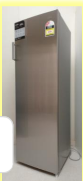
Freezer soon to be well stocked for night competition

On the list for this year is the replacement of the internal fence. If all goes well with our synthetic courts we are looking at replacing the fence during the April school holidays.