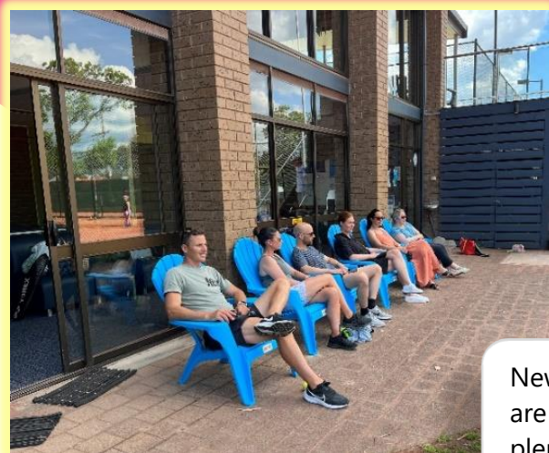
New chairs are getting plenty of use