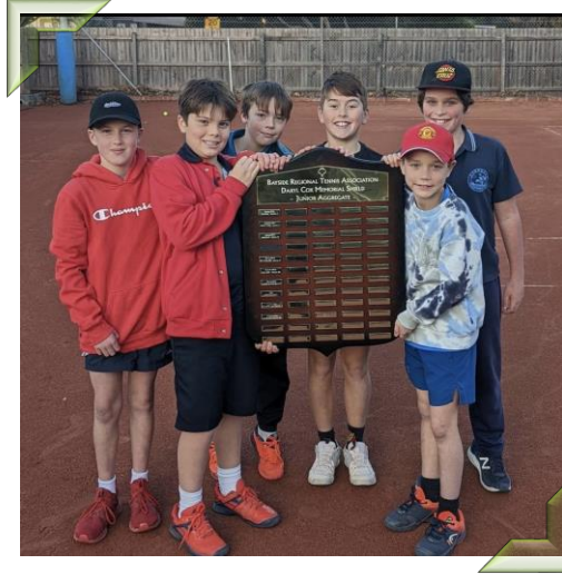
Section 20 won the Daryl Cox Memorial Shield.

This trophy is awarded to the junior in the tournament who best displays the qualities and values of Rafa - humility, resilience, sportsmanship and commitment.