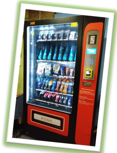
Vending machine that supplies tennis balls , drink and snacks located in the Junior Clubroom.