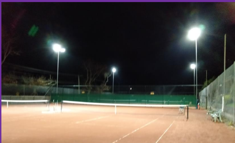
Lights for our en tout cas courts – funded by Kingston Council