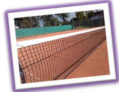
New net on court 3