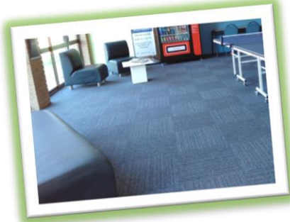
New Carpet in the Junior Club Room