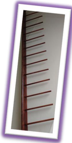
Pennant Holders The Mens Shed