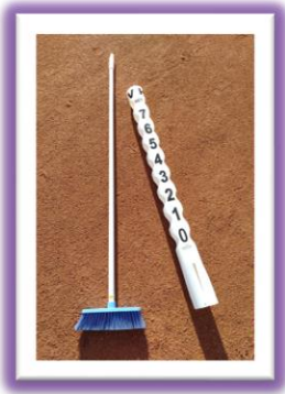
New Brooms & Score Tubes