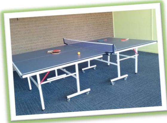
A ping pong table from T & R Sports was purchased for the Junior Clubroom. The service we received from T & R Sports was excellent, they also gave our club a discount.