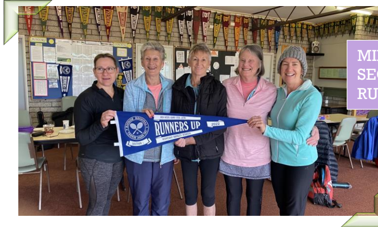
MIDWEEK LADIES SECTION 1 RUNNERS UP